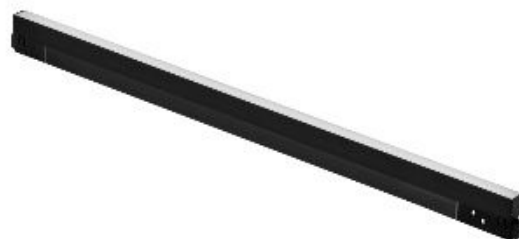
Magnetic LED light to be installed on 48 V magnetic track